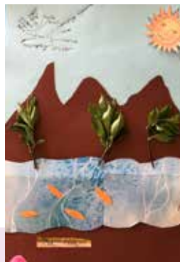
Quinn, aged 12