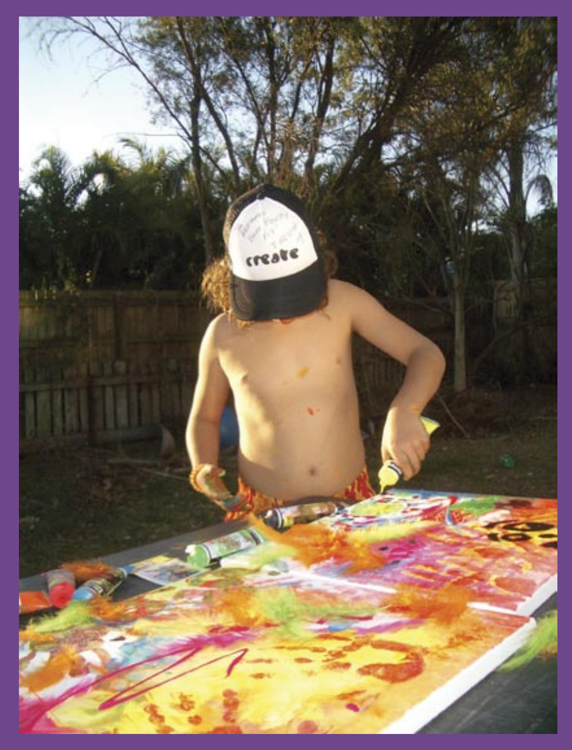
Australian Children and Young People In Care REPORT CARD ON HEALTH